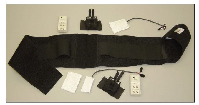
Figure 1) Infrared lower back pain wrap (MSCT Infrared Wraps Inc, Canada)

It contains an IR-emitting element in a unique design with an IR grid and buzz bars down each side to deliver the electricity, converting it to IR energy at a wavelength of 800 nm to 1200 nm.